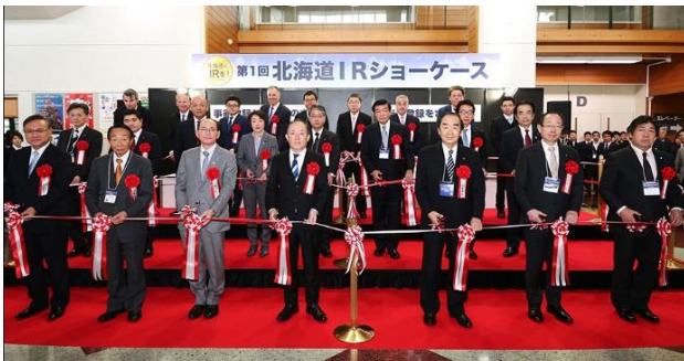
"1st Hokkaido IR Showcase" on Jan. 9, 2019 Opening Ceremony (Ribbon Cutting Ceremony)

In July 2018, the Specific Complex Tourism Facilities Area Development Bill, the so-called IR Bill, passed and was approved by the Diet. As a result, the development of complex tourism facilities including casinos will progress in Japan, which promote long-stay tourism. In response to the great success of the "1st Hokkaido IR Showcase" held in January 2019, the demand for trade shows of the "IR industry" is increasing. Therefore, we have decided to hold an exhibition that brings together products and services indispensable for Japanese IR.